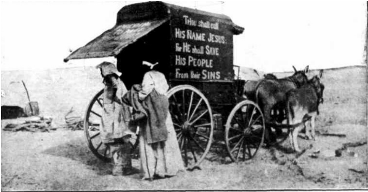
Fig. 2. 'Two sick lubras alighting from itinerant preacher's van at the isolation area, Oodnadatta'. Rev. Kramer used his caravan to transport Aboriginal patients to the isolation hospital.

Nursing and caring for those alive, we had a busy time for about six weeks, until the epidemic ceased, losing not an opportunity to teach them of the great love of Jesus, who died to save us all. 48